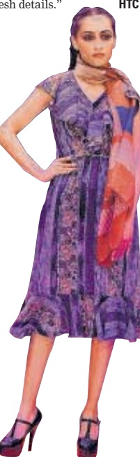
The collection features a wide range of ensembles that are perfect for both for women and men