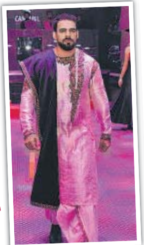
A model walks the ramp in a dhoti-kurta