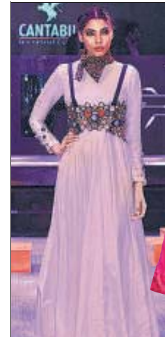
(Above and right) Models showcasing fusion dresses