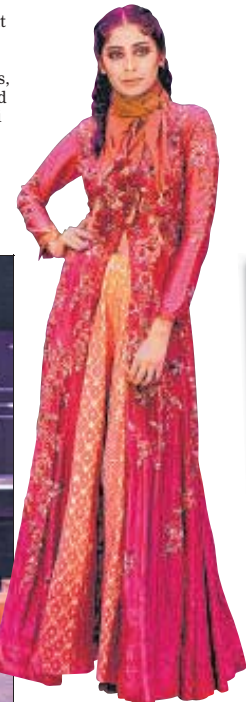
A model poses in an anarkali kurta with jacket