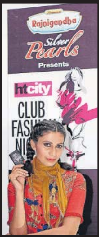
A model showcases Rajnigandha Pearls, flavoured cardamom seeds, at the HT City Club Fashion Nights 2018 held in the Capital